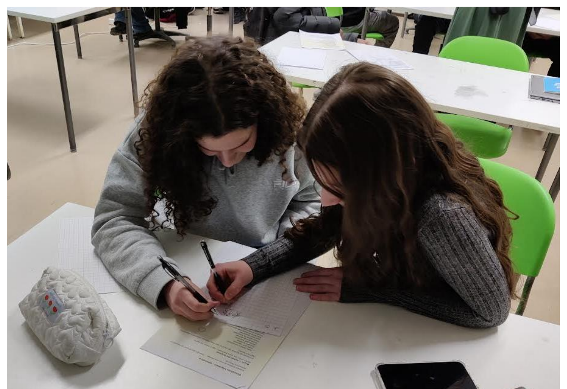
Two students work together in Albanian.